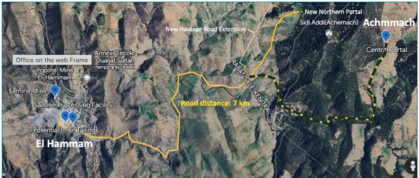
Figure 1. Existing haulage roads between Achmmach and El Hammam

Samine had been operating the El Hammam mine since 1974. The mining operations ceased in 2021, however, operations remain in place to recover low grade fluor spar materials for sale to cement producers in Morocco.