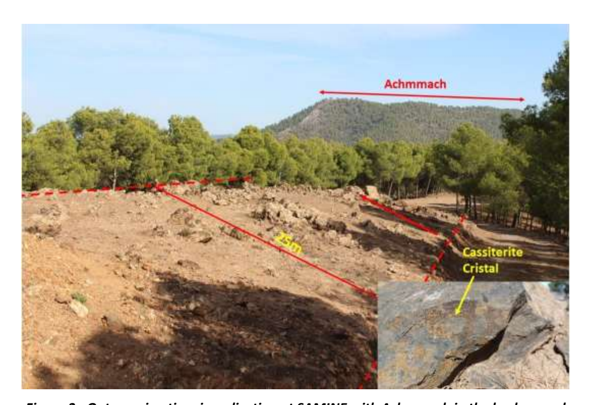
Figure 3 - Outcropping tin mineralisation at SAMINE with Achmmach in the background

Exploration work completed to date consists of detailed geological mapping and 1,200 soil samples taken on an 80m x 80m grid along the full prospective strike length of the SAMINE corridor which is located between Achmmach and Bou El Jaj. This extends the strike length of the mineralised corridor to approximately 10km ( Figure 4 ).