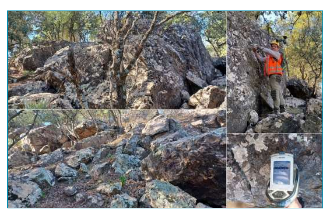
Figure 2 - Outcropping tin mineralisation at SAMINE